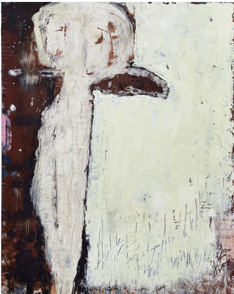
ONIRICA- The Personals © Melinda Stickney-Gibson 2021