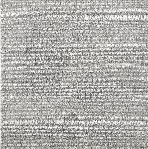
f*** this © Gary Gissler 2019