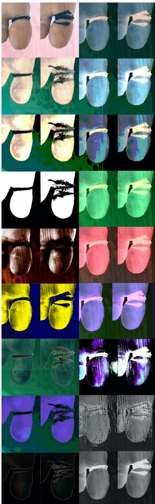
#1Toes © Kaethe Kauffman 2022 limited edition print on silk 36 x 72 inches copy

More about Kaethe Kauffman: www.kaethekauffman.com