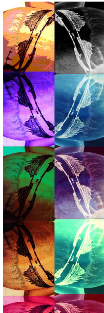
Back Swirl © Kaethe Kauffman 2022 limited edition print on silk 30" x 65" inches.jpg